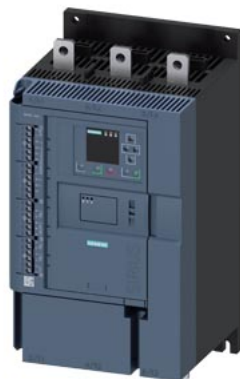
SIRIUS soft starter 200-480 V 210 A, 110-250 V AC Screw terminals